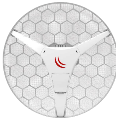
LHG HP5 / LHG 5 ac